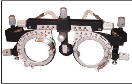
Universal Trial Frame