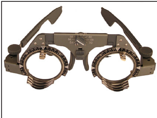
Universal Trial Frame LW