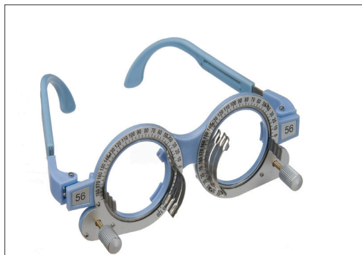
Child Trial Frame