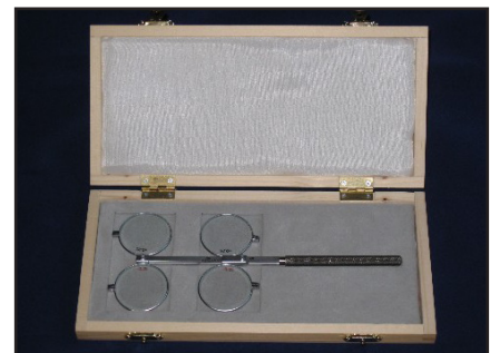
Adjustable Confirmation Flippers